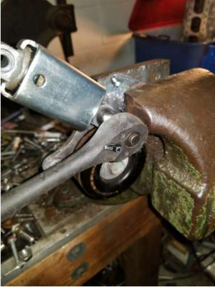
13) Remove Spring